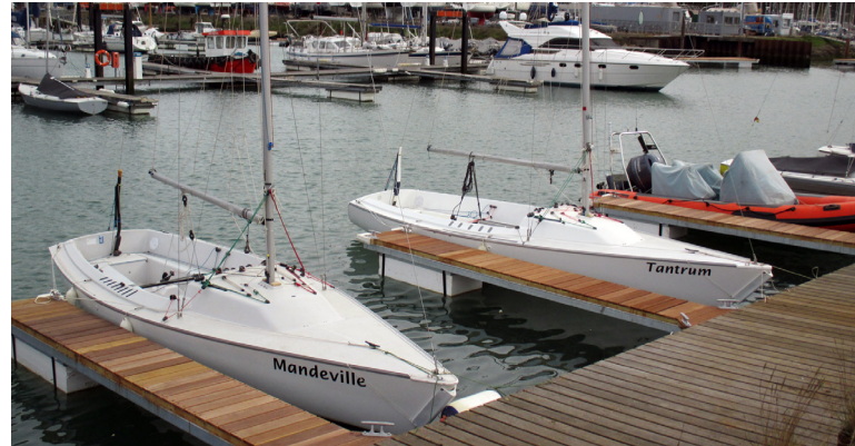
EAST's new Sonars, Mandeville and Tantrum

The maintenance team continued to work all through the summer concentrating on the two new sonars adapting them for our disabled sailors. Maintenance this winter has also been ongoing with restrictions on volunteer numbers. We are hoping to get four sonars in the water for the coming season.